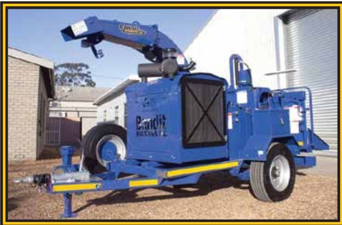
MODEL 12XP BLUELINE DIESEL