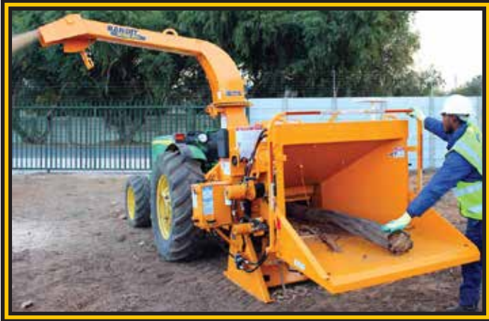
MODEL 95XP PTO