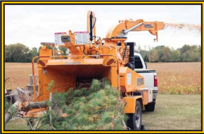
MODEL 19XP DIESEL