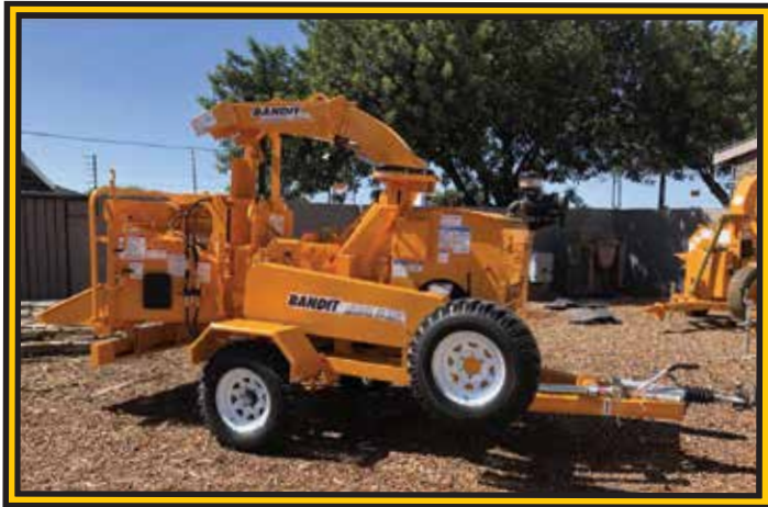
MODEL 12XPC DIESEL