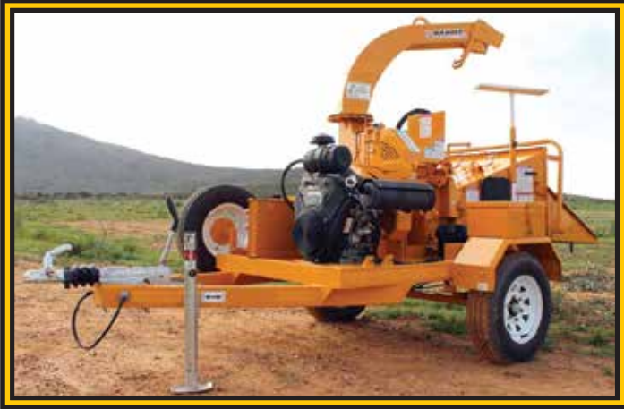
MODEL 75XP PETROL