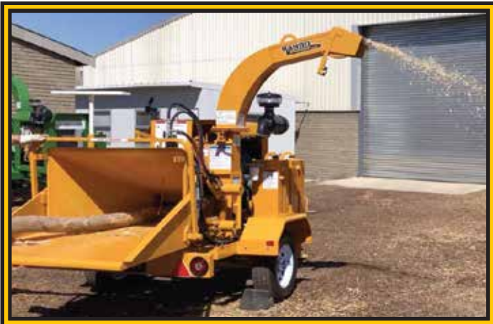
MODEL 75XP DIESEL