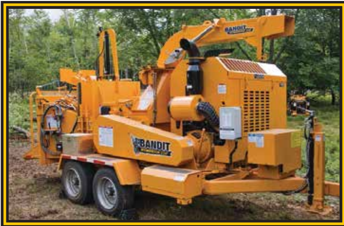
MODEL 21XP DIESEL