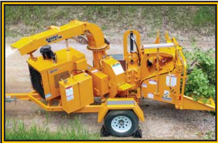
MODEL 90XP DIESEL