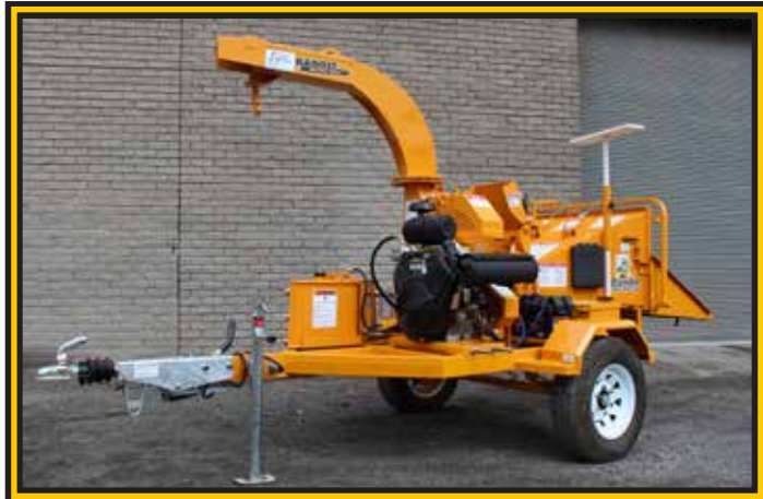
MODEL 65XP PETROL