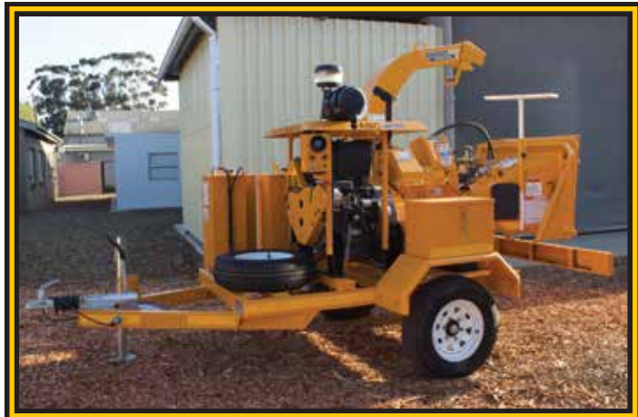
MODEL 65XP DIESEL