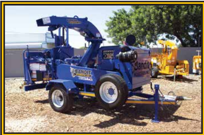
MODEL 15XP BLUELINE DIESEL