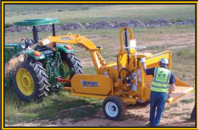
MODEL 15XP PTO