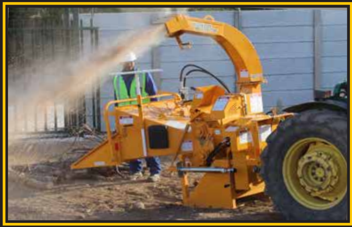
MODEL 65XP PTO