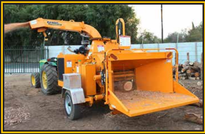
MODEL 18XP DIESEL