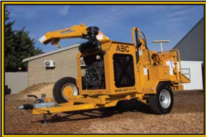
MODEL 15XPC DIESEL