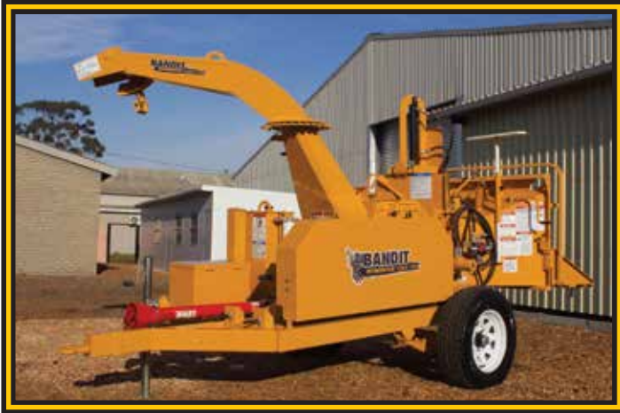
MODEL 12XPC PTO